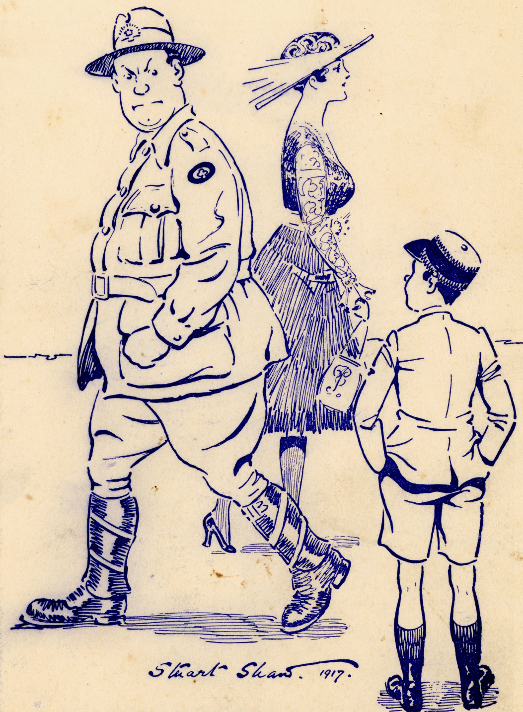
Overheard in a French Village. The Boy: "Hello, Bully Beef!"